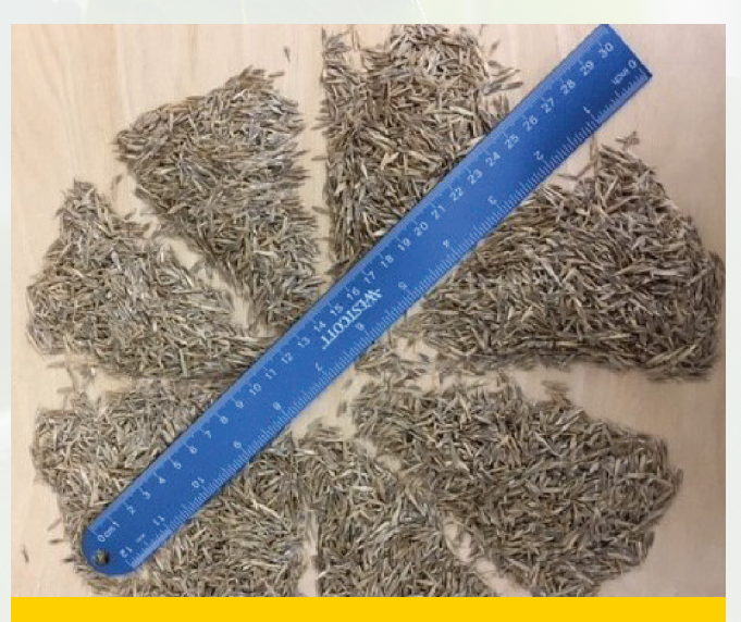
FIGURE 6. Pie halving method for chaffy species

samplers or achievement of ISTA authorized seed sampler. Upon completion of the online course, written exam and on-site practical exam attendees are eligible to draw samples for ISTA Orange certificate testing. This course allows staff to attend the majority of the training at their facility greatly reducing the travel time and expenses for training.