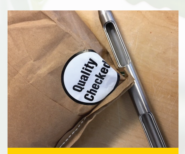
FIGURE 7. Double tube probe for many small seeded vegetables.