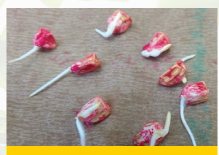
FIGURE 2. Sweetcorn "weak" seedlings after 7 days growth in rolled towels.