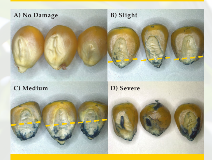
FIGURE 3. A) None: no visible damage to pericarp covering, B) Slight: tearing of pericarp area extending up less than 25% length of embryo pericarp margin/edge, C) Medium: tearing of pericarp extending up to 50% of length of embryo pericarp margin/edge and D) Severe: cracks over the embryonic axis and major breaks in seed or missing parts of the seed.